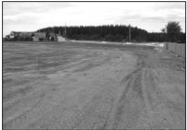
The treated and levelled area looking towards the channel and Rabbit Island

The beach was successfully replaced with new marine gravels and finished to the contour of its original shape. Previously the walkway above the beach was opened for public use, including a new easy access ramp from the top of the new rock wall along the shore back down to the beach. With the successful completion of the foreshore near the Smokehouse, the contractors will begin removing security fencing which had closed off this section of the foreshore to the public. A similar fence moving out from the shore at the other end of the beach fronting the site was also erected. The fencing was originally put into position to protect the public when heavy earth-moving equipment was operating on