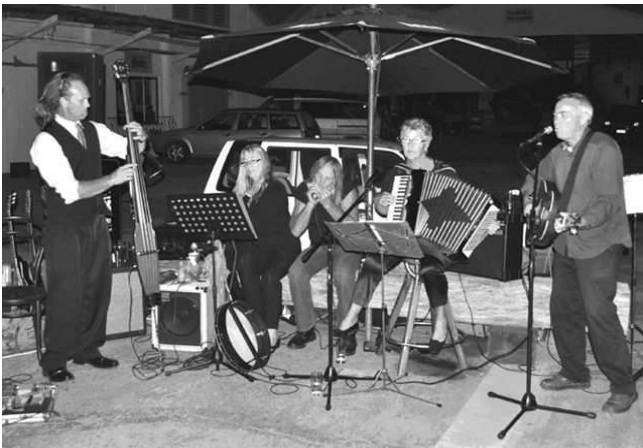
Riffraff in action