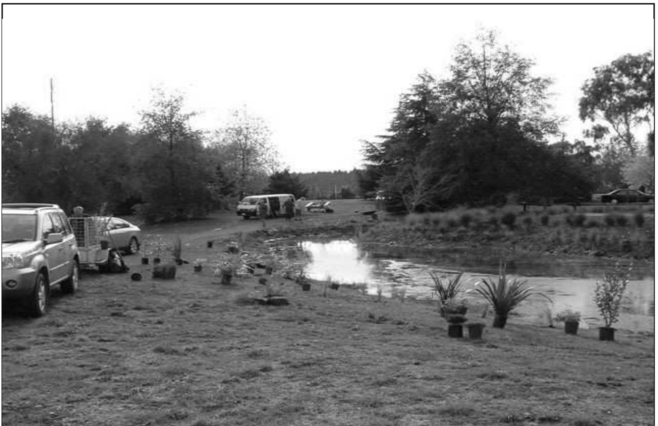
The Friends of Aranui Park are making steady progress towards the beautification of the area around the pond. Along with Tasman District Council staff "friends" planted a variety of 350 plants around the pond, which looked good after some rain.