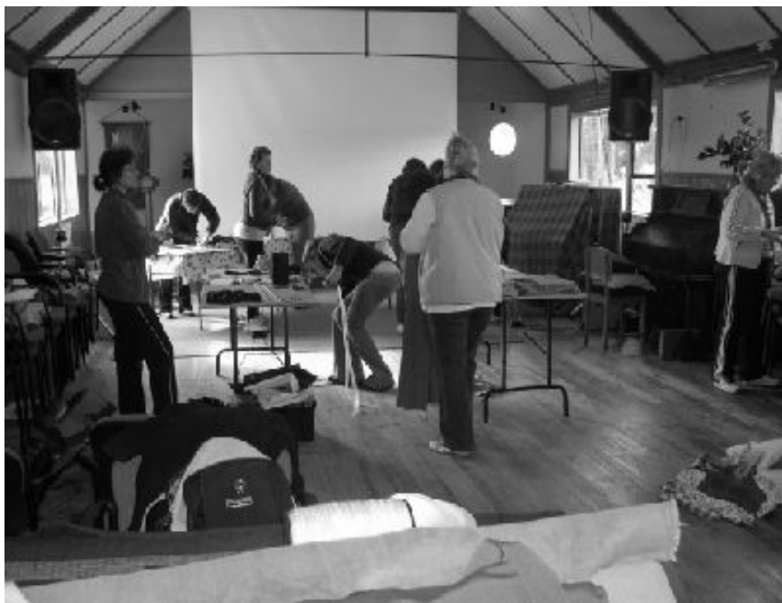
Our thanks to Hills Community Church who provided the venue for our working bee