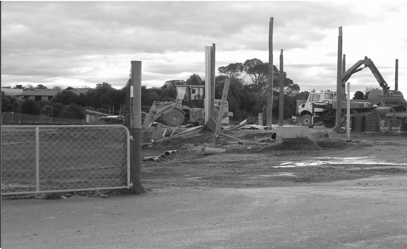
The FCC site with the last remnants of the decontamination plant—some poles and concrete.

After more than 2½ years the EDL plant has finished its work of processing contaminated soil at the former FCC Mapua site, and the machinery has been removed.