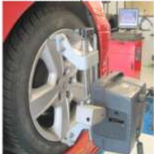
A sensor attached to the rim of a front wheel. The base computer unit is in the background with a graphic image on the screen showing the current alignment settings for this vehicle.

Wheel Alignment -Keeping straight on the road- All mechanical equipment, can become worn and out of 'alignment' when used. Vehicles are no exception. How many times have you hit a pot hole, had the whole car shake and think 'I wonder if that did any damage?'. Well chances are it did, however not enough for you to notice as after a few minutes the car is still driving fine and you forget about it, but your car doesn't. Small incremental changes in your vehicle's wheel alignment will alter how the vehicle performs, affecting how long your tyres last and can cause problems driving. Computerised wheel alignment testing equipment uses four sensors, one attached to the rim of each wheel. These sensors communicate from rear to front via an optical beam to the base computer unit.