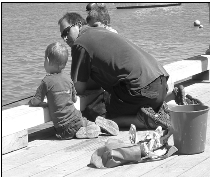
It's never too early to learn the art of fishing.