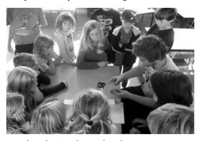
Learning to make trench-periscopes.

As well as our science theme, we have been learning about Anzac Day and what it means through visiting the WWI trenches at the 'Lest We Forget' exhibition at Founders' Park. We followed this with a visit to the Nelson Museum to learn about the role of the modern armed forces in Afghanistan. These visits made a big impact on the kids as they bought alive some of the experiences and stories from the war that they have read about but may not have completely understood before. We completed this topic by building our own World War 1 trenches in Kotuku class. Our senior students were required to spend one school week in the trenches, trying to find their way around while carrying on with their normal routines. We wanted to make the experience as real as possible, and it will be an experience they will never forget.