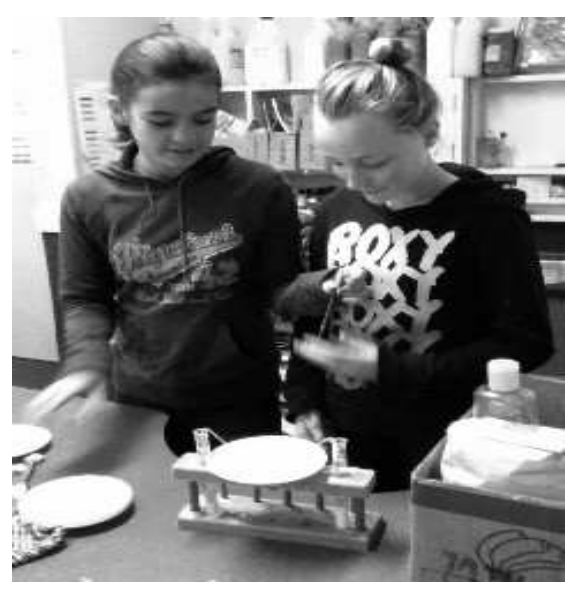
Two girls with science project

The sea is stained red Clouds of smoke suffocate me Gunfire cuts off screams.